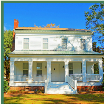
Bland–Chestnut–Turner (c. 1842)

In addition to the private homes, tour guests are invited to explore two of Selma’s most treasured historic landmarks. Sturdivant Hall Museum (F:10-4, S:10-2) showcases the grandeur of Greek Revival architecture with its iconic columns, imported Italian marble, and timeless elegance, while the Vaughan–Smitherman Museum (F:10-4, S:10-12) stands as a cornerstone of Selma history built as a school for orphans and children of Masons, it has served as a Confederate hospital, the Dallas County Courthouse, a military school, and the Vaughan Memorial Hospital through the years.