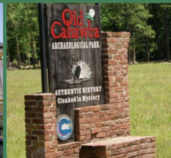
Old Cahawba St. Luke's