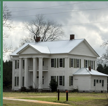
Cochran/Crumptonia House (c. 1855)