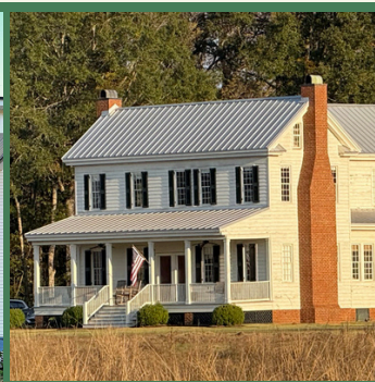
Molett House (c. 1819)