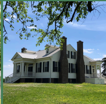
Pope–Givhan (c. 1838)