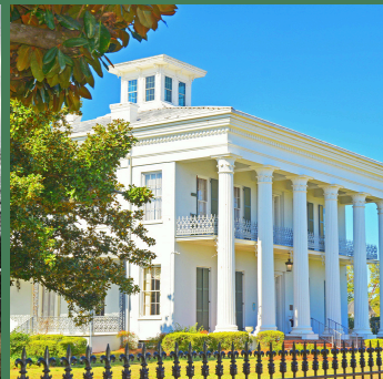
Sturdivant Hall (c. 1856)