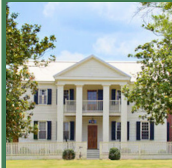
Tasso (c. 1830s)