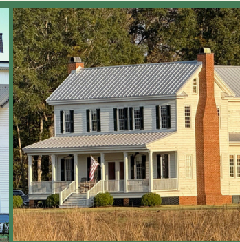
Molett House (c. 1825)