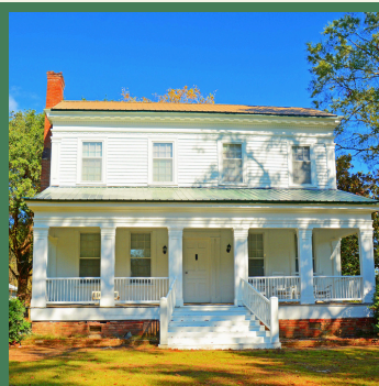
Bland–Chestnut–Turner (c. 1842)

In addition to the private homes, tour guests are invited to explore two of Selma’s most treasured historic landmarks. Sturdivant Hall Museum (F:10–4, S:10–2) showcases the grandeur of Greek Revival architecture with its iconic columns, imported Italian marble, and timeless elegance, while the Vaughan–Smitherman Museum (F:10–4, S:10–12) stands as a cornerstone of Selma history built as a school for orphans and children of Masons, it has served as a Confederate hospital, the Dallas County Courthouse, a military school, and the Vaughan Memorial Hospital through the years.