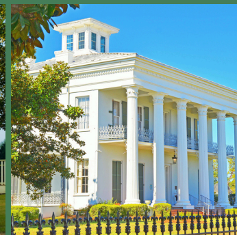
Sturdivant Hall (c. 1856)