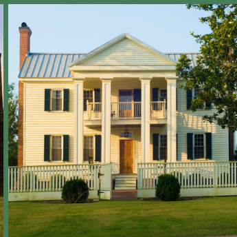
Tasso (c. 1830s)