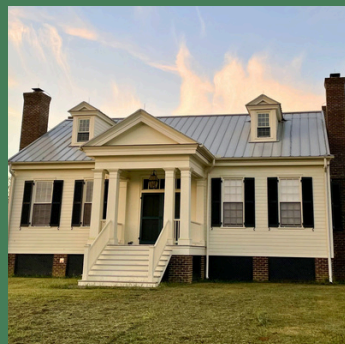
Pope–Givhan (c. 1838)