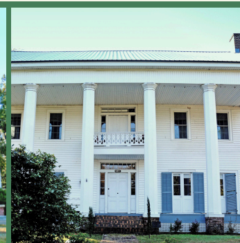
Mill–Albritton (c. 1854)