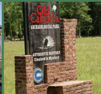
Old Cahawba St. Luke's